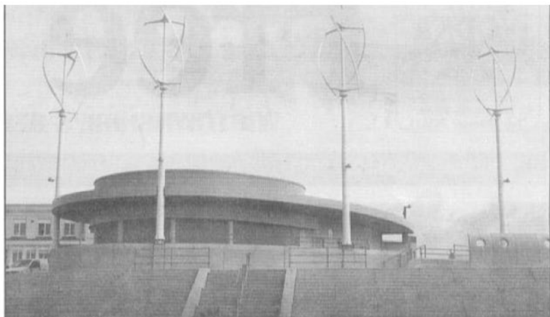
URBAN LANDSCAPE . . . These Quietrevolution turbines don't look out of place at the Cleveleys Promenade in Lancashire. (NN)