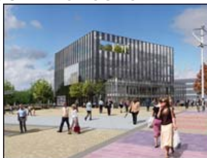
A £32.6m Civic Hub will be built in Corby

A £50m regeneration landmark buildings project to transform Corby has been given the go-ahead by councillors.